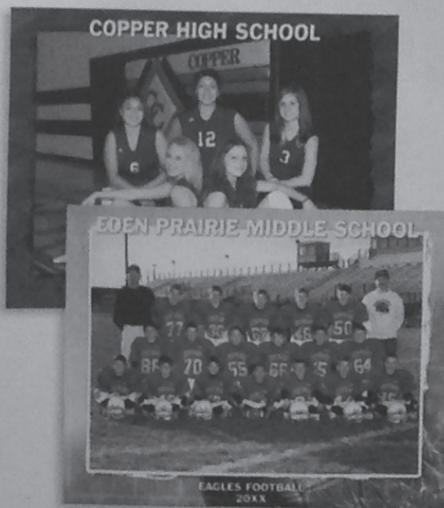
8x10 Bordered Team